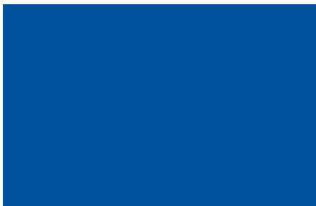
Blue PANTONE® 661C